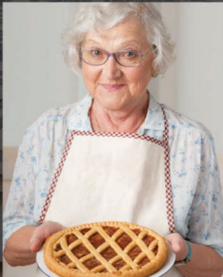
Grandma invites you to a family "thing."

If they call ...this is where things get hairy, and you have to think on your toes. The simpler, the better. No need to lie. Just say, "I'm already in my pajamas; I just wanna' have a lazy day." If they ask to join, that's on you. Your friend won't be pissed for long if you just want to be alone. So be honest and blunt. But also don't treat your friend like a plague and avoid them for long. It won't kill you to have a good time with them (well, usually...).