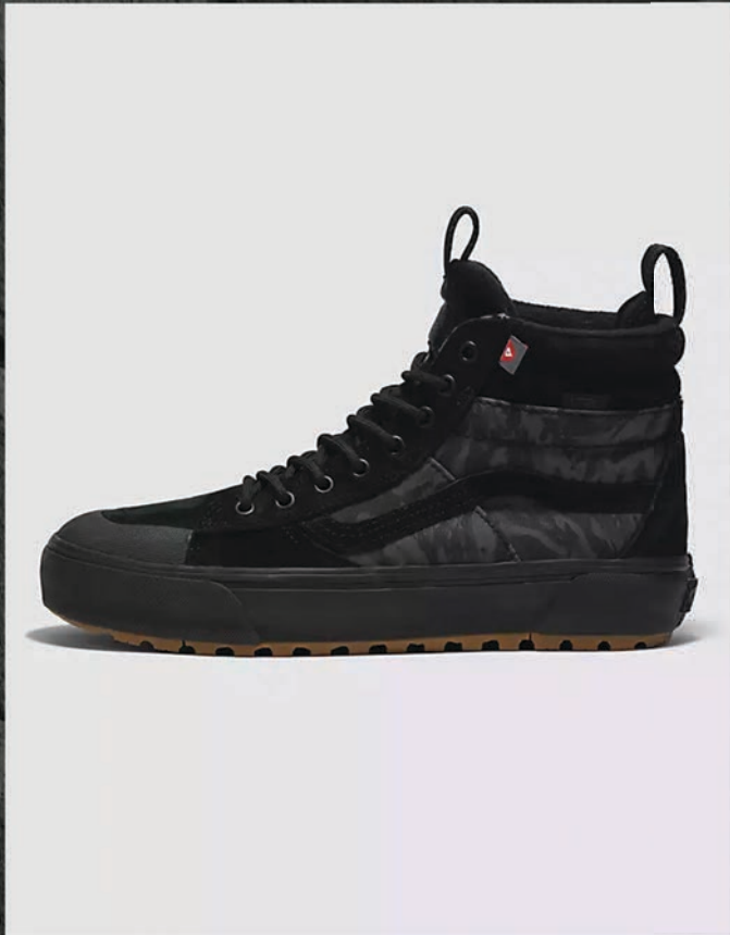
Vans Sk8-Hi MTE-2 Shoes