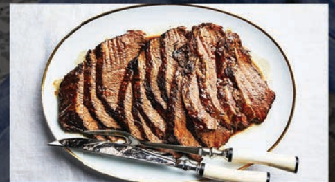
Hair or nail appointment you can't afford anymore.

Unless there is free booze, bonuses, and brisket...and it's not far away, most people don't like going to these things. Use the same excuses you've been using on your grandma or friend, and you'll be fine. Maybe someone will bring you some leftover brisket at work on Monday.